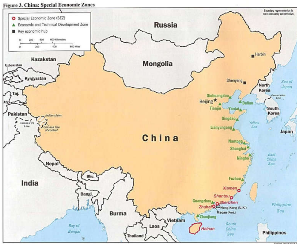
Figure 3: China's Economic Zones