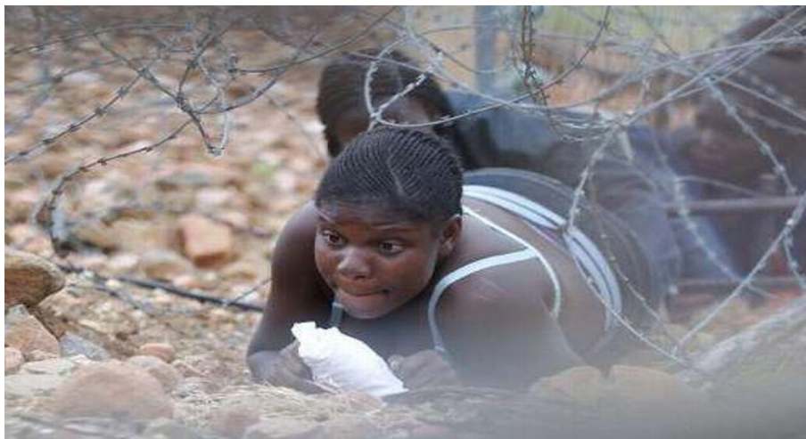
Above: picture shows a Zimbabwean illegal cross border near Beitbridge boarder post

Zvemari's lamentation will be of no relevance to the audience but only an advocate of crime, because some people could see Zvemari's illegal way of crossing the border as ideal but it has its own consequences which made some people succumb to death due to animal attacks for instance there are some instances whereby Zimbabwean illegal cross borders were killed by wild animals to only those who were fortunate enough they could escape but in many cases they could sustain life injuries. However, Pepukai Zvemari can also be credited for being the voice of the voiceless fellow countrymen who could not or sometimes afraid of pointing a figure to the government's failures through social media video clips. As part of the techniques used by Zvemari in this video clip he uses the Karanga dialect as his main language, the Karanga dialect is popular in the Midlands and some Southern parts of Zimbabwe.