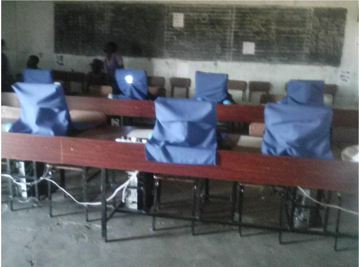
Figure 4.3: Some of the computers at School B

During the study, it was revealed that there was inadequate of computers in some schools. Proving it impossible to use computers. From the observation made it emerged that so many schools out of five did not have adequate computers. However, all the schools had at least one laptop. Only school B had 10 desktop computers (see figure 4.3).