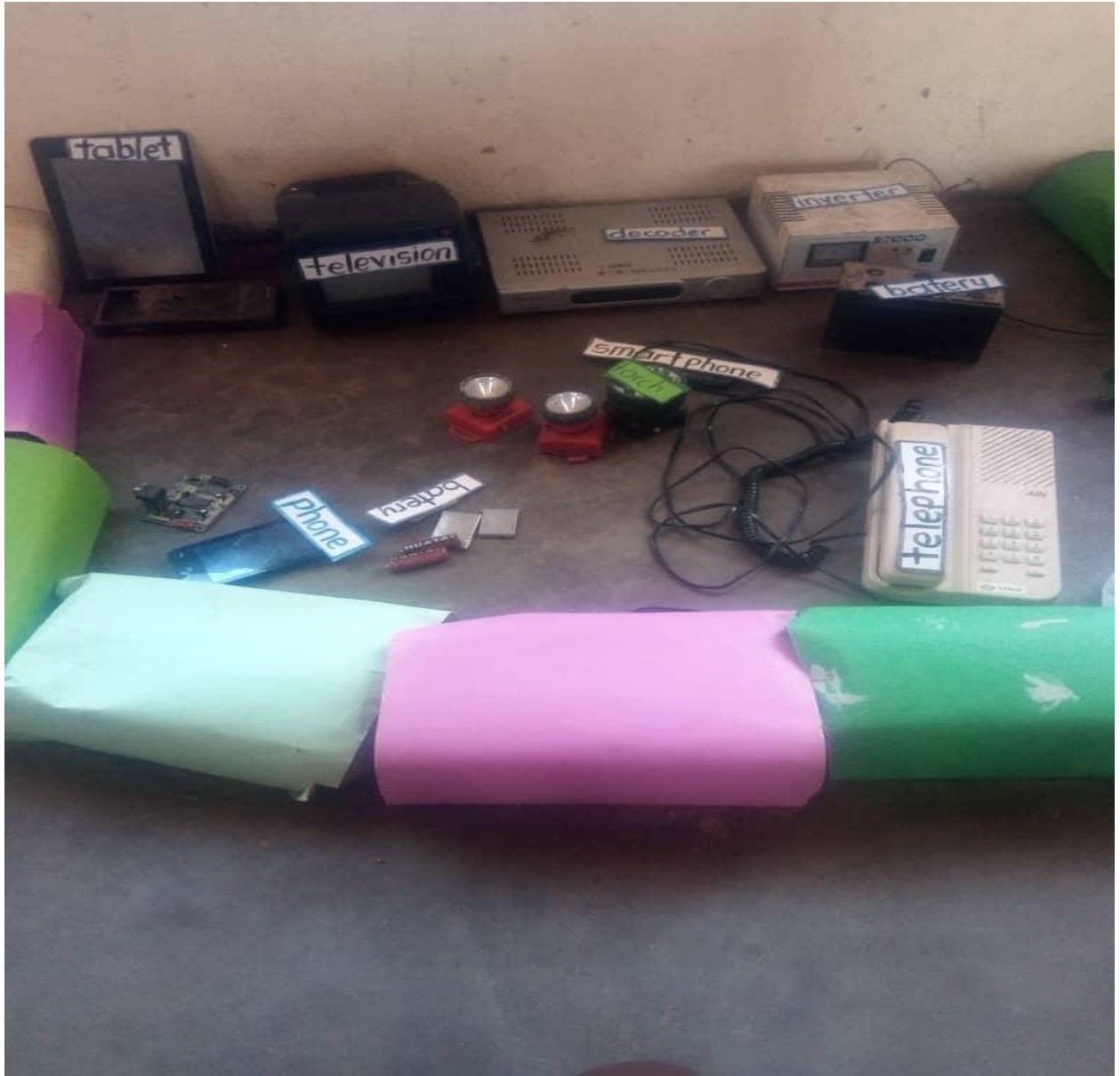
Figure 4.2: ICT learning corner at School A

reality. Models of ICT gadgets were observed in the ICT learning areas created by teachers (see figure 4.2).