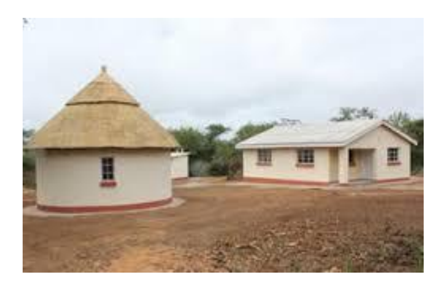
Fig 7 A picture showing the houses built by the Chinese for the relocated family in Arda Transau

Beside the fact that the available resource could sustain and benefit the available population of Chiadzwa through infrastructure development, the formalization of diamond mining in Chiadzwa by the Chinese Companies did not represent any form of community development or empowerment. Infrastructure development was not a priority among the miners.