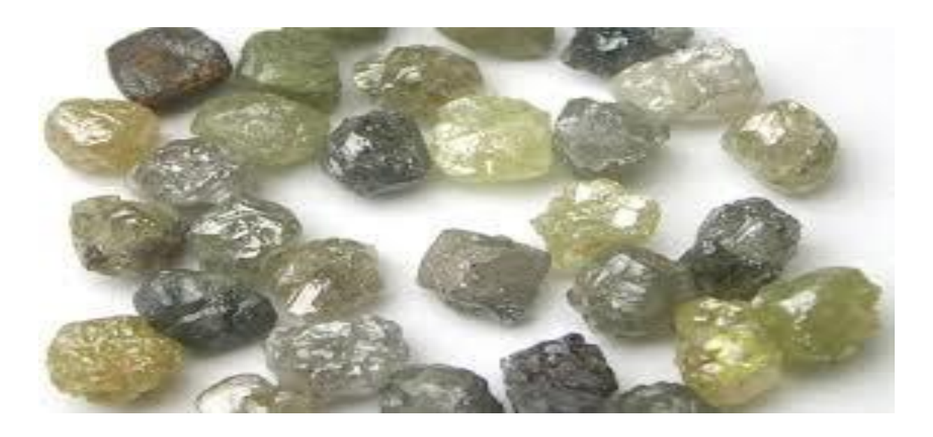
Insert 3 showing three types of diamonds (ngoda,ngodagirazi and girazi) found in Chiadzwa

The mineral was of different size, shape and value which enhanced the miners to categories and further grades the diamond into three categories. There was the black industrial diamond which they called ngoda, this was the lowest paid type of diamond, the lowest valued of all diamonds. The other type was the pure or clear diamond which they called girazi, this was the most valued. Finally there was what they referred to as ngoda-girazi, this was identified as half ngoda black industrial diamond and half girazi pure or clear diamond, and it followed the clear or pure diamond in the range of prices.