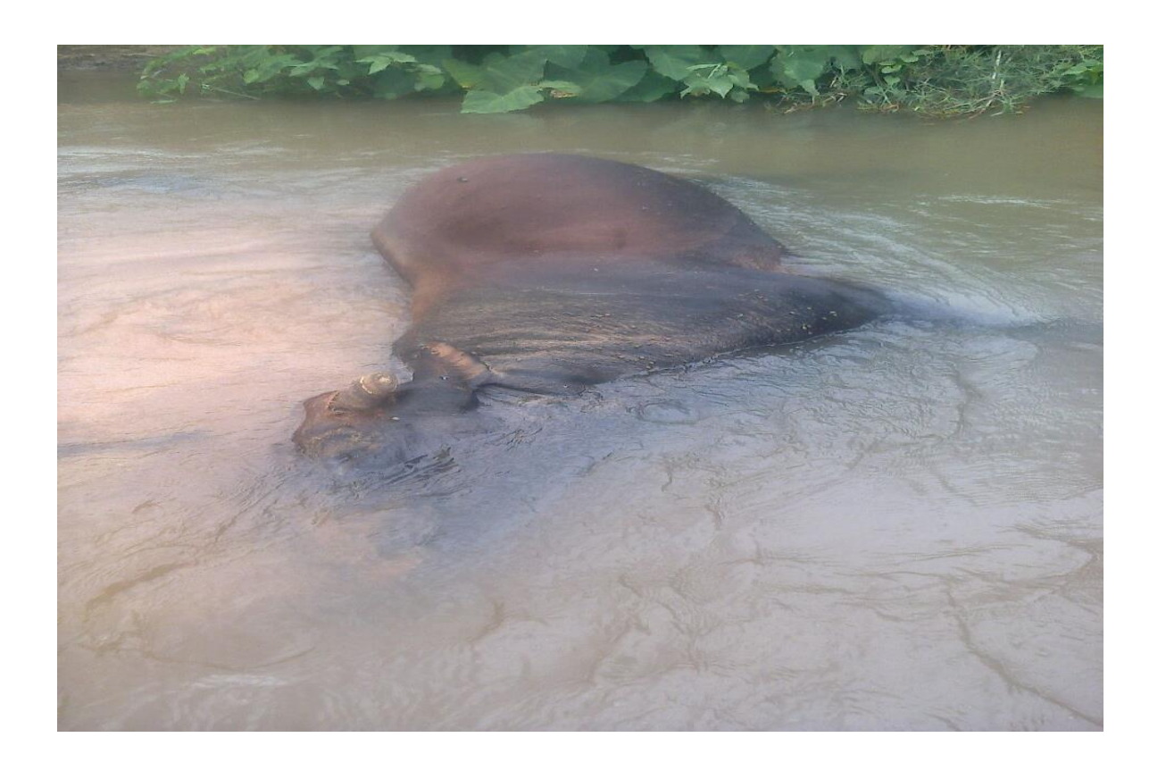
Fig 10 showing already dead cattle affected from drinking polluted water in Odzi River.

"It all started in 2010 when the companies come in and we were happy that development has visited our area not knowing disaster finally come. The rivers are polluted at daily bases, during the early days the Chinese deposit at any time of the day and pollution become the order of the day and it became difficult for us to utilise the water to drink or for domestic use. When the pollution was at its height we engaged our chiefs to go and dialogue with the companies that's when they changed the time of discharging their polluted water thou it was not so easy to fool us we could even notice in the early mornings with mud-chocked river banks. The water contains chemicals that had an effect to human beings and animals. The communities lost thousands of cattle which were not even compensated. I personally lost 40 cattle some of them died during giving birth and am left with 3 luckily survived oxen. Those cattle were the only source of income and am left nowhere to depend on. The effect spread even downstream areas where Odzi and Save converge. The pollution of the local water sources marginalised the community capacity to develop even though with the closure of companies they have already in the past destroyed us." 20