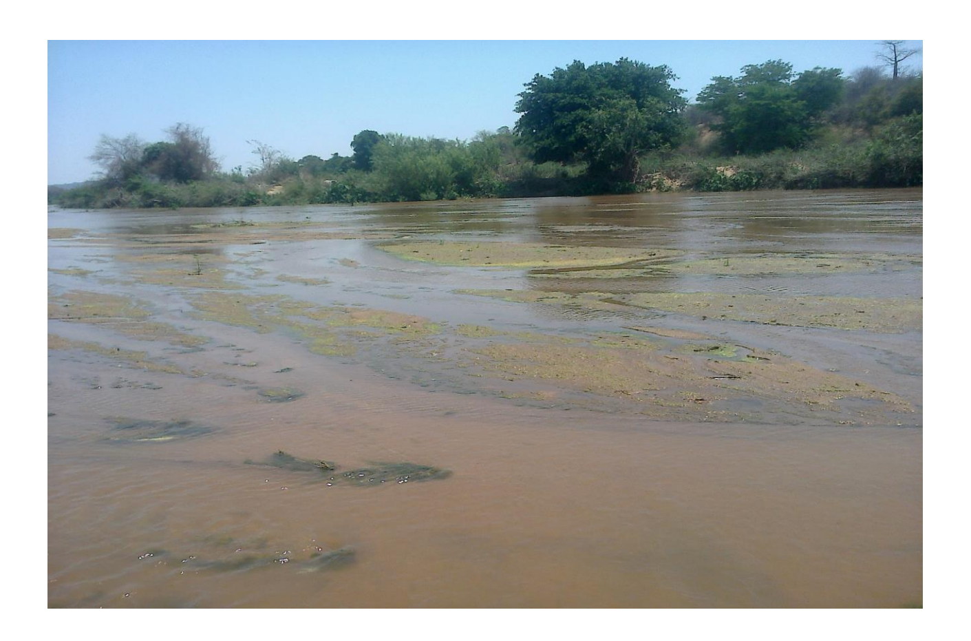
Fig9 showing the polluted water from Odzi River during the early mining when the Chinese directly deposits sewage into Odzi River.

More than 1000 cattle die from mining pollution, according to The Zimbabwean newspaper an interview with M Karenyi who had over 60 cattle she lost 55 of them due to polluted water, she said that the cattle become clumsy, then grew huge bellies and eventually unable to walk. There was also the experiencing of still births, it's now difficult to send children to school since cattle was a source of income and she no longer have enough to sell.<sup>19</sup>