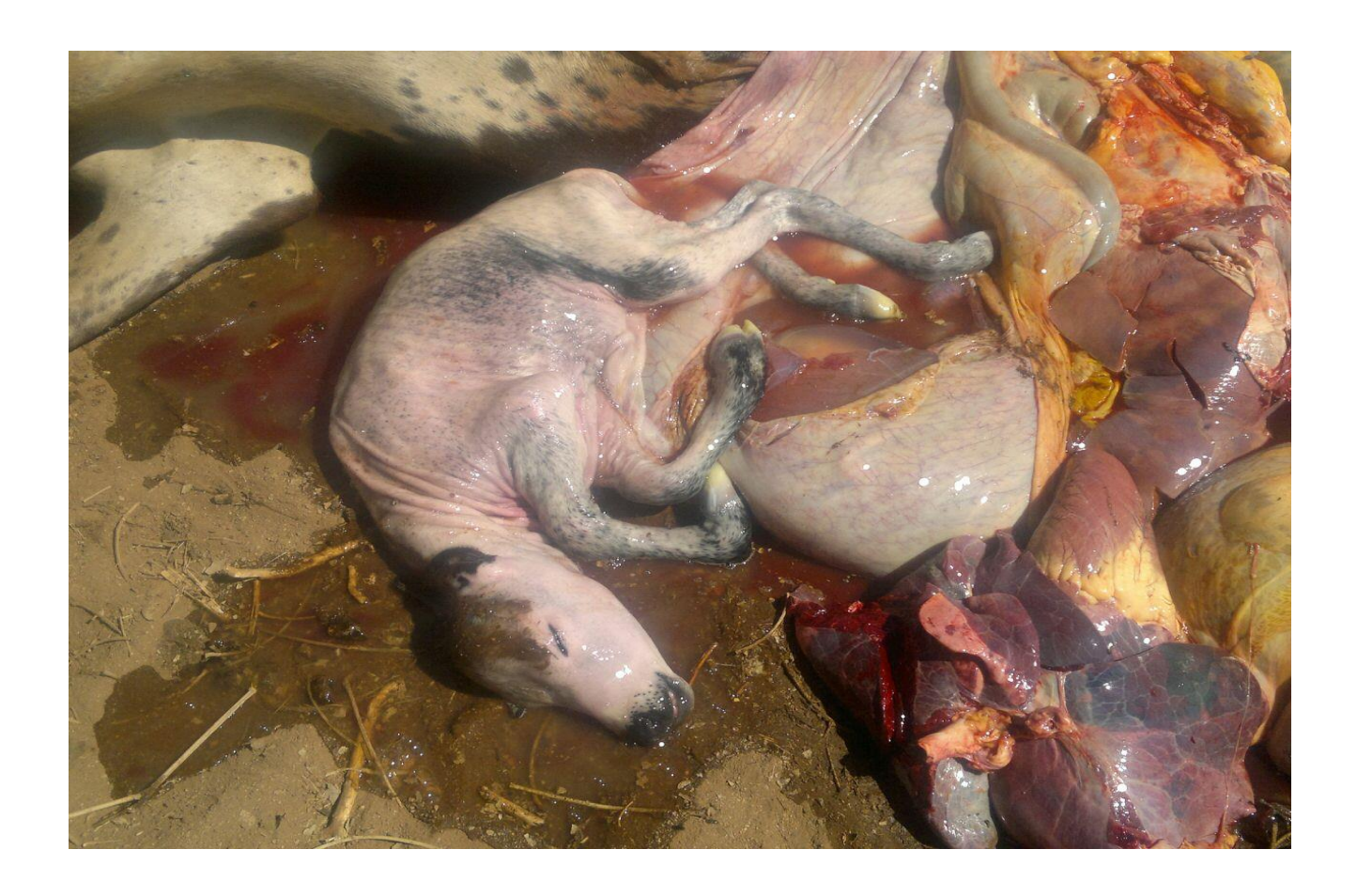
Fig 12 showing a dead cattle with a premature calf also die due to polluted water in Save River.

Water problems caused much trouble which includes loss of livestock. According to the Standard newspaper, an interview with Headman Nelson Mangwadza point out that, "Save River is now heavely contaminated. We have lost so many cattle and goats since the mining venture started. There is really nothing we benefited from the diamond in terms of infrastructure development. Only a few individuals were employed from my area and we were not even included in Zimunya Marange Community Share Ownership Trust here besides being close to diamond. We are living in a sea of poverty yet a few kilometres away there are diamonds"