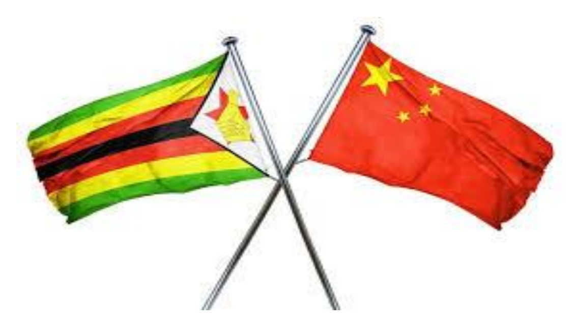
Insert 5 Showing cross cutting flags symbolising Sino-Zimbabwe relationship.

the Zimbabwe Mining Development Company (ZMDC) taking 10 percent and the remaining 50 percent belonged to the Chinese investors.<sup>4</sup> According to Zimbabwe Situation, upon the granting of the concession and permission to mine, Zimbabwe moved seven steps upwards to become the world's seventh diamond producer.<sup>5</sup>