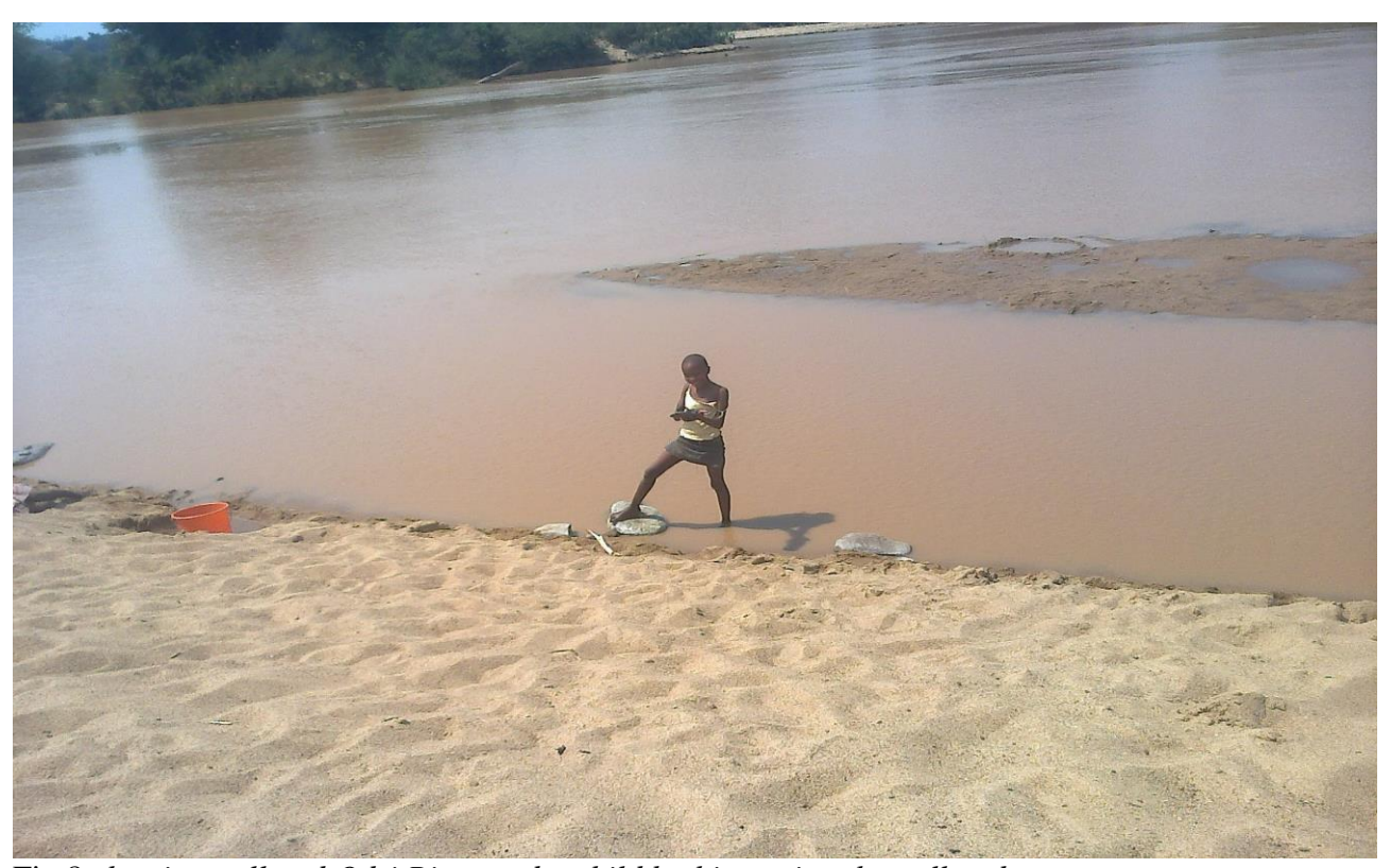
Fig 8 showing polluted Odzi River and a child bathing using the polluted water.

choked in the river bed and banks, and the presents of chemicals which are causing itching of skins. The discharge after the sorting process caused the water to be turbid. The people living along the rivers experienced mining as a disaster for the polluted water contains chemicals that maddening heath conditions and even the domestic animals. Several people along Save-Odzi River lost their cattle especially those residing near the source of discharged polluted water. Reports by Zimbabwe Environmental Lawyers Association (ZELA) support the constant perishing of cattle in the communities along Save-Odzi River due to chemicals.