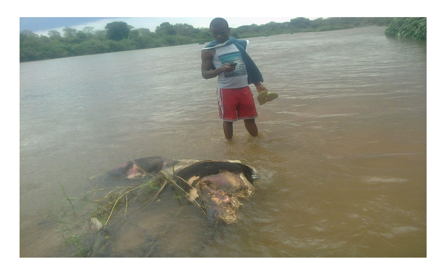
Fig11 showing a decay cattle in Odzi River as a result from continuous drinking of chemical polluted water.