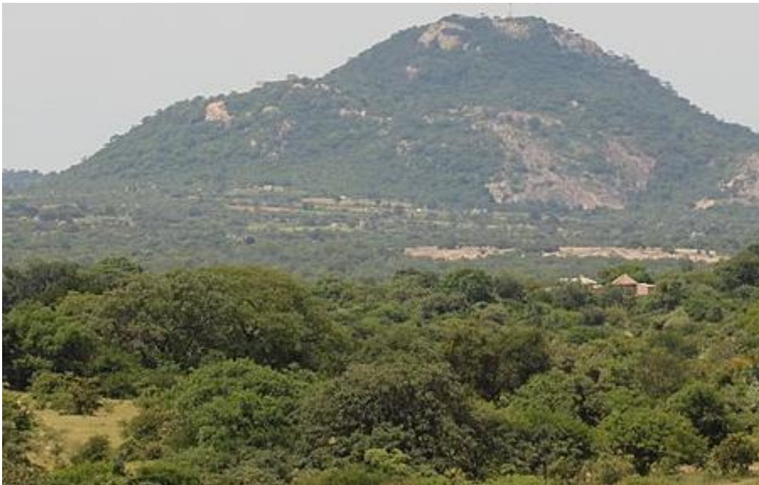
Figure 4.1 Gombe Mountain