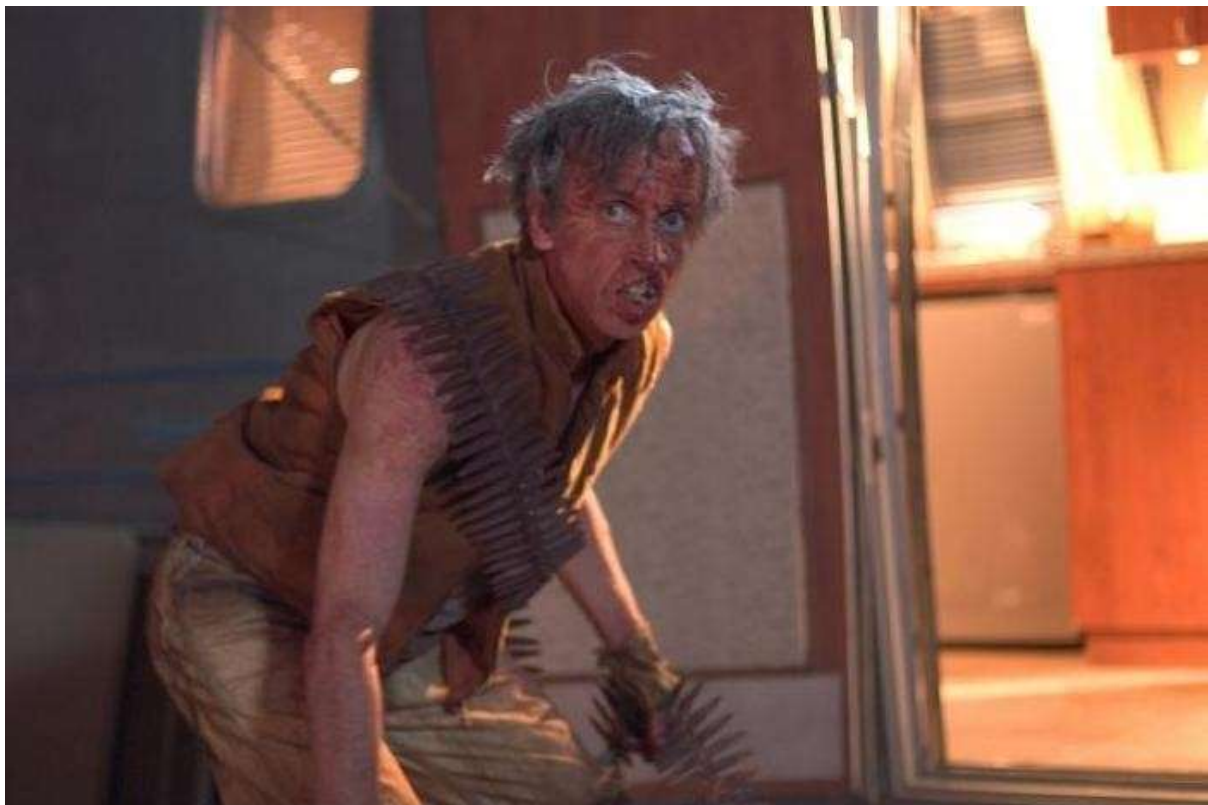
Figure 1 excerpt from the Hills have eyes