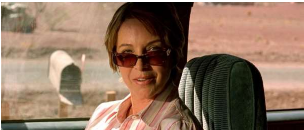
Fig 3 Makeup of the lady as soon as they get to the desert

When analysing the costume, it can be noted that they are wearing tattered, dirty clothes that have no buttons and the clothes have no colour matching code. All this is done to create horror at the same time it being realistic to the audience. In contrast the family that unfortunately gets trapped in the dessert are dressed in costumes that have colour the lady pink stripped shirt, lipstick wearing sun glasses another wearing a floral dress that suggests a jovial mood as they are going on vacation and unaware of the fate that awaits them.