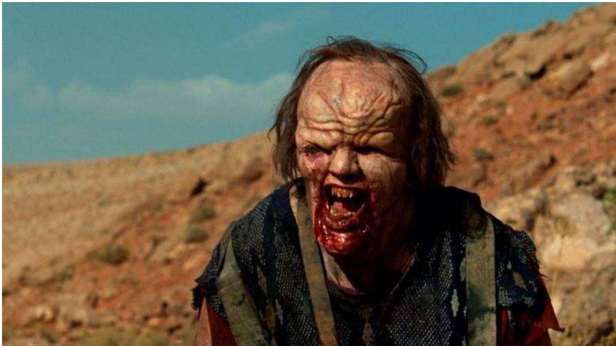
Fig 2 Excerpt from the horror film the hills have eyes

The above stated suggests that semiotics plays an important role in helping to create psychological effects in the viewers. In the film The Hills Have Eyes the costumes of the scary characters have dark and dull colours. The colours used are black and brown. The colour black suggests evil which if one possesses, gains authority and in some cases is used to show danger, as a result the horrific human beings have authority in the Mexican desert.