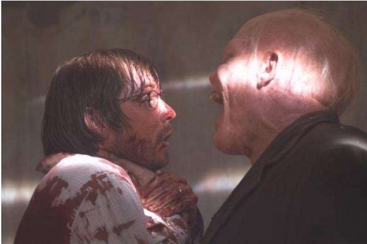
Fig 4 an example of a horrific scene when the actor struggles against the monster in order to survive evidence of the development of the film plot as the costume is now dirty with blood stains and the makeup suggests so as well.

As the plot of the film develops due to them finding themselves in a compromised situation, their clothes get blood stains, become dirty and tattered this suggests the development of the film plot, change of atmosphere both in the film and in the audience as this evokes feelings of fear and pity whilst watching the horror film.