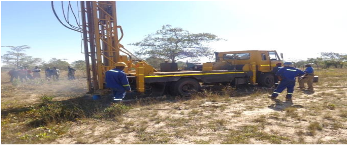
Borehole drilling taking place in ward 6.