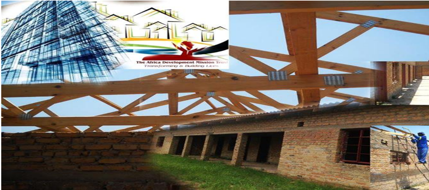
Gora Clinic Maternity Wing under construction in 2012.

The picture below illustrates a development project in the working at ward 6.