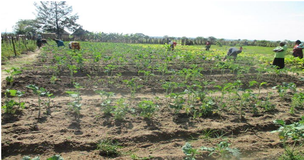
Zinhu Village Garden Scheme, Ward 6, Mhondoro Mubayira Constituency.