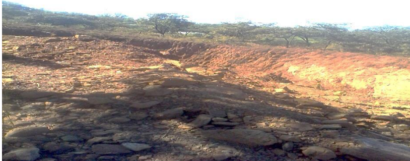
Fig 1.2 Land degradation

that. These pits are very deep that if a person come closer to them that person might fall on those pits. This is evidenced by the picture below.