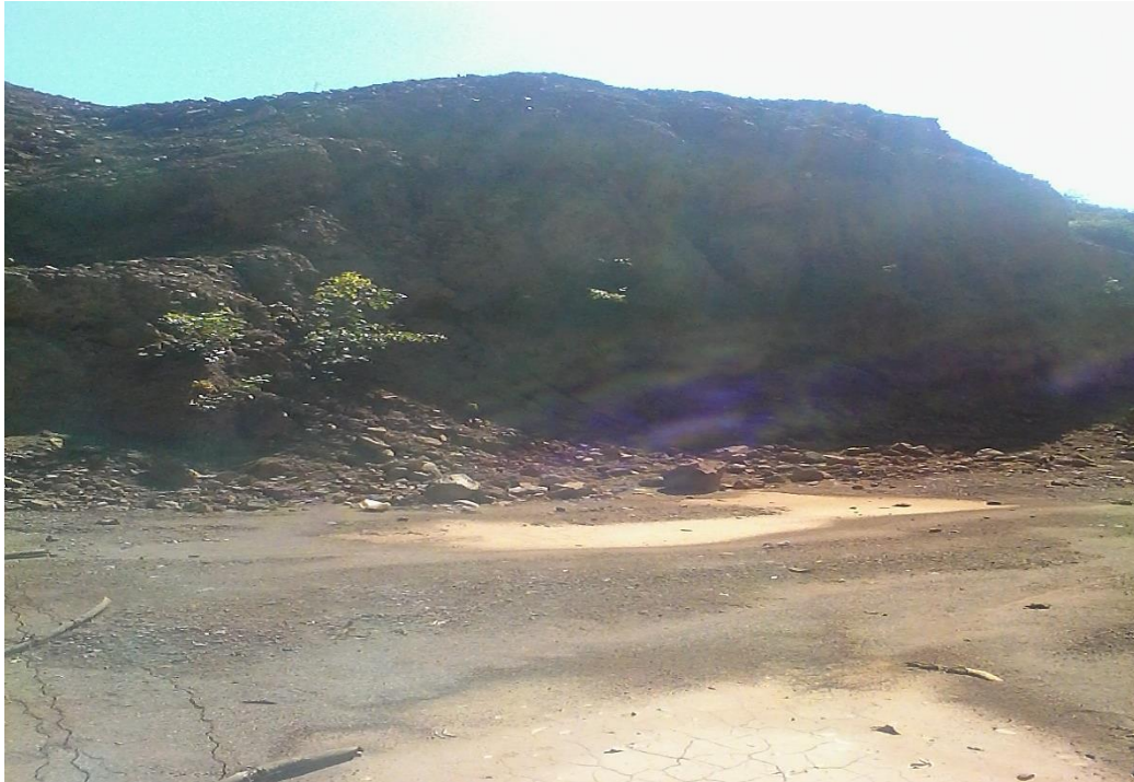
Fig 1.3 Deep pits left uncovered by the ASM

overpowered waylaid the rival group and attacked back. There is also an incident which took place early this year were two ASM attacked a man and dragged him into the forest so that his dead body could not be seen by anyone. As fate has it these two people's plan failed to work as they were caught at the act.